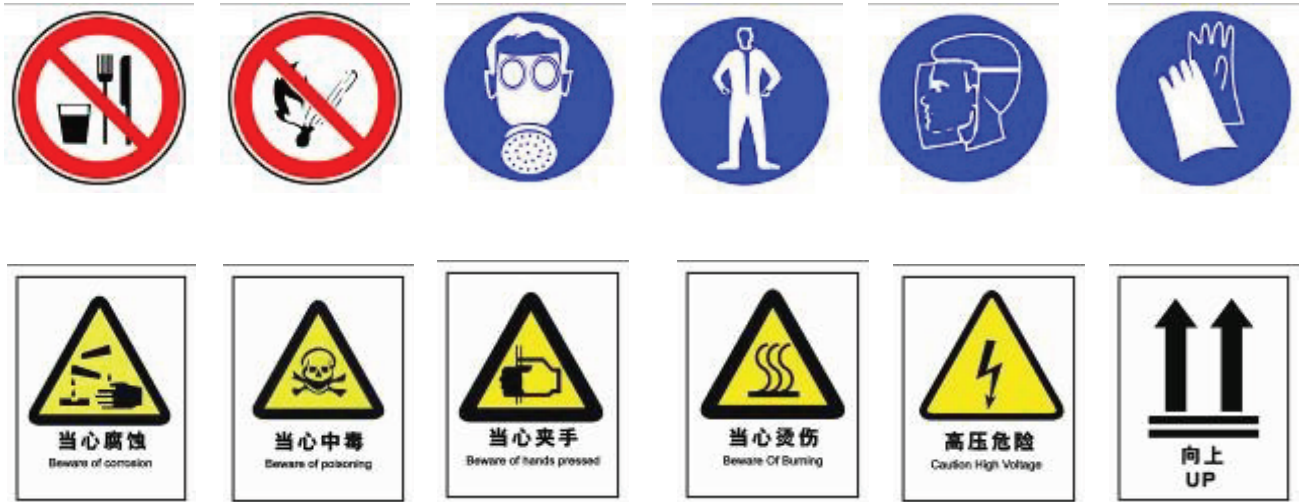
Various safety signs